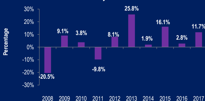
Fund Yearly Return

This fund's objective is to obtain maximum long-term capital growth. It invests primarily in equity and equity-related securities of companies whose primary operations are outside of North America. The fund may make significant investments in any country including emerging markets and emerging industries of any market. The fund has a 3 year return of 6.3% and a 5 year return of 10.3% as at March 31, 2018. The Fund also has a 6 month return of 5.1%.