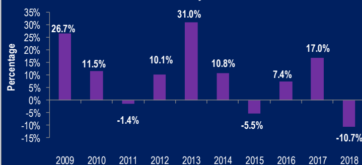
Fund Yearly Return

This fund's objective is to provide superior returns with a limited level of risk by investing in a diversified portfolio of high quality undervalued companies. It invests primarily in equity and equity-related securities of companies in the United States. Any change to the investment objective must be approved by a majority of votes cast at a meeting of shareholders held for that reason. The fund has a 3 year return of 8.1% and a 5 year return of 5.7% as at March 31, 2019. The Fund also has a 10 year return of 11.1%.